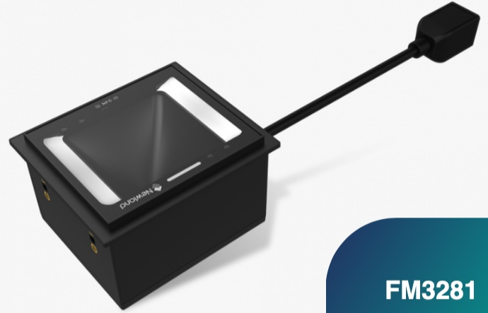
FM3281 Grouper Stationary Scanners